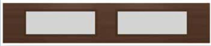
Clear View Sealed Glass