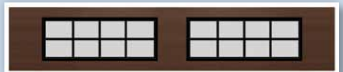
Stanton Wide Black Muntin Bars