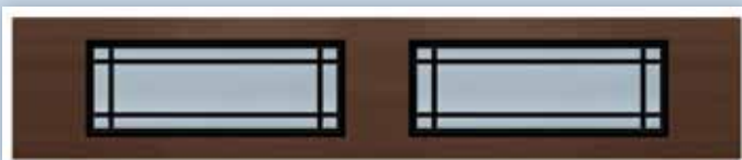
Satin Texture Glass & Regal Wide Black Muntin Bars