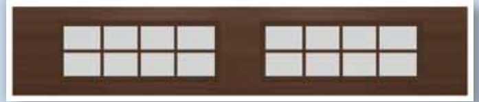
Stanton Wide Bronze Muntin Bars