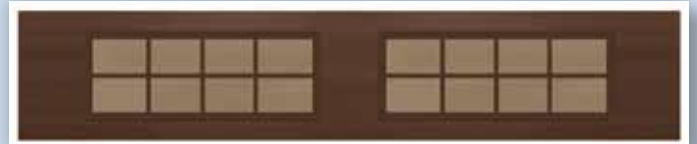
Bronze Reflective Glass & Stanton Wide Bronze Muntin Bars