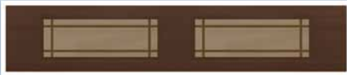
Bronze Reflective Glass & Regal Wide Bronze Muntin Bars