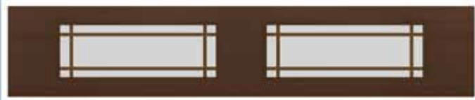
Regal Wide Bronze Muntin Bars