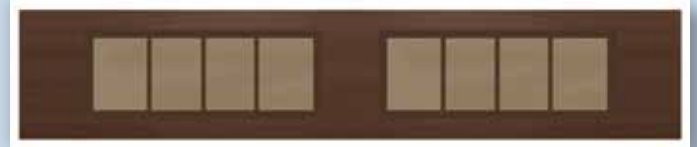
Bronze Reflective Glass & Provincial Wide Bronze Muntin Bars