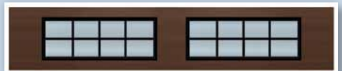
Satin Texture Glass & Stanton Wide Black Muntin Bars