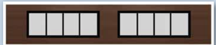
Provincial Wide Black Muntin Bars