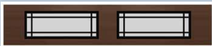
Regal Wide Black Muntin Bars