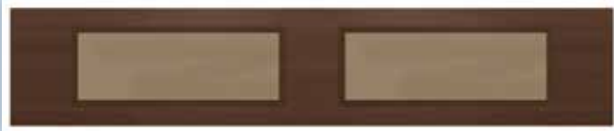
Bronze Reflective Sealed Glass