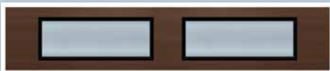
Satin Texture Sealed Glass